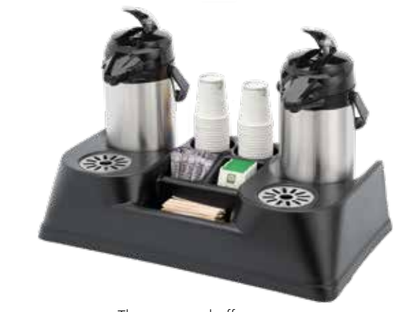
Thermos jug buffet

Perfect for cleaning thermos jugs and places that are difficult to reach.