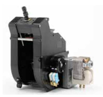
Reversed espresso brewer system; 230 V motor, silent, delicious crema and no drip